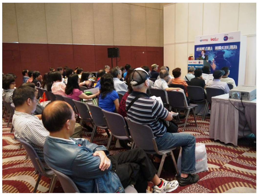
The ETF workshop received enthusiastic response from the audience.