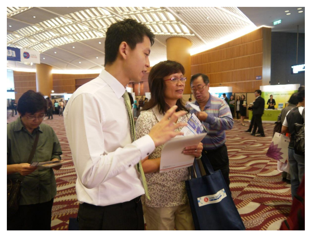
The business development team of PAAMC (HK) introduced the Ping An China/HK ETF Series to participants, explaining the "core-satellite" concept of the products.