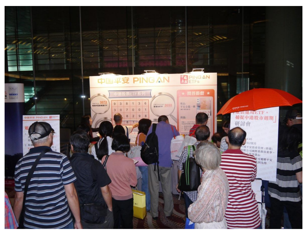
The interactive bingo game was well perceived, enhancing the knowledge of retail investors about the Ping An China/HK ETF Series.